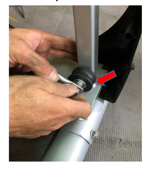
Step 1: Lock the nuts.