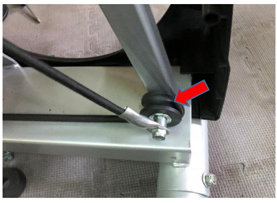
Step 5:Circle the strap here.