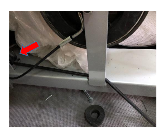
Step 4:Circle the strap to here.