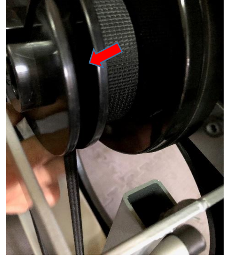
Step 6:Circle strap to here.