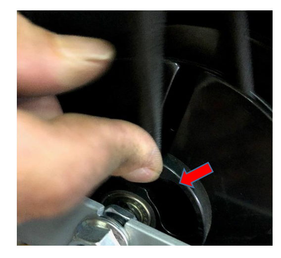
Step 4: Strap will be pulled out at this end.