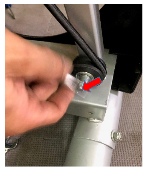
Step 3: Pull out the strap.