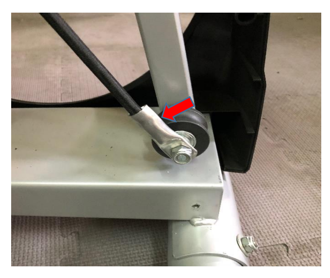
Step 2: Lock the nuts and strap's angle like this.