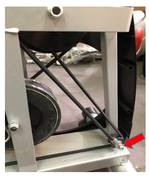
Step 2: Take off the nuts.