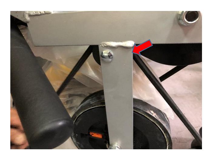
Step 3: Circle the strap to here.