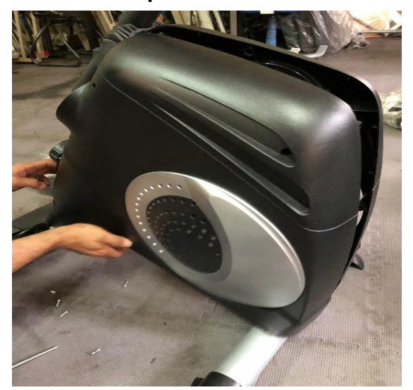
Step 1: Take off the cover.